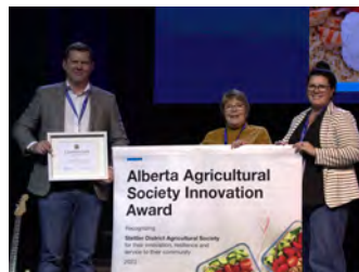
Stettler District Agricultural Society