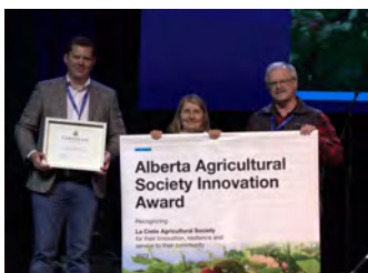
La Crete Agricultural Society