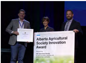
KAC Agricultural Society